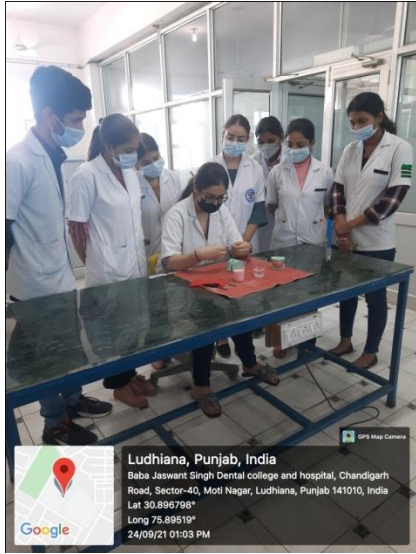
DEMONSTRATION OF HABIT BREAKING APPLIANCE