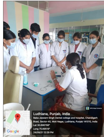
DEMONSTRATION OF SPACE MAINTAINER