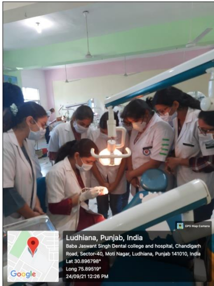
DEMONSTRATION OF CAVITY CUTTING ON TYPHODONT