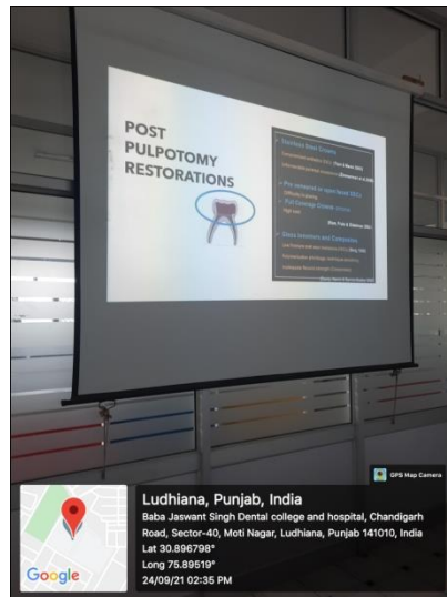
LCD PROJECTOR IN THE DEPARTMENT