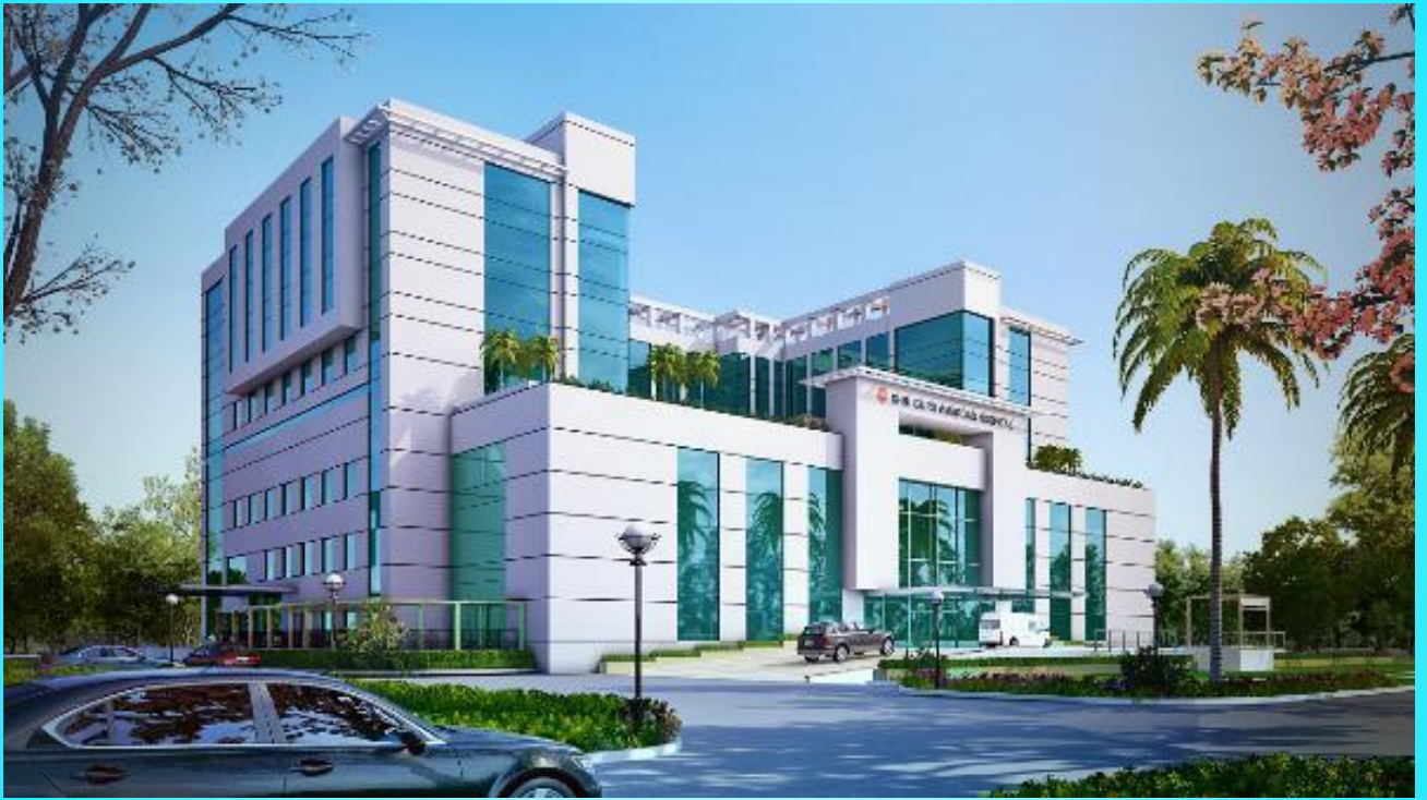
Shri Guru Amardas Hospital Chandigarh Road, Ludhiana